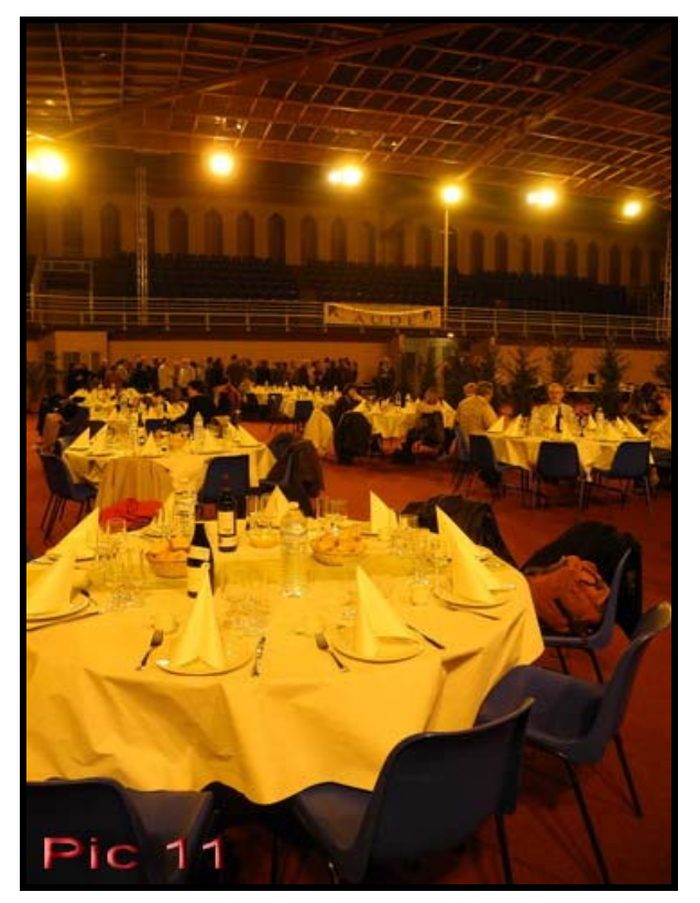
Pic 11, 12: did I mention the food.....