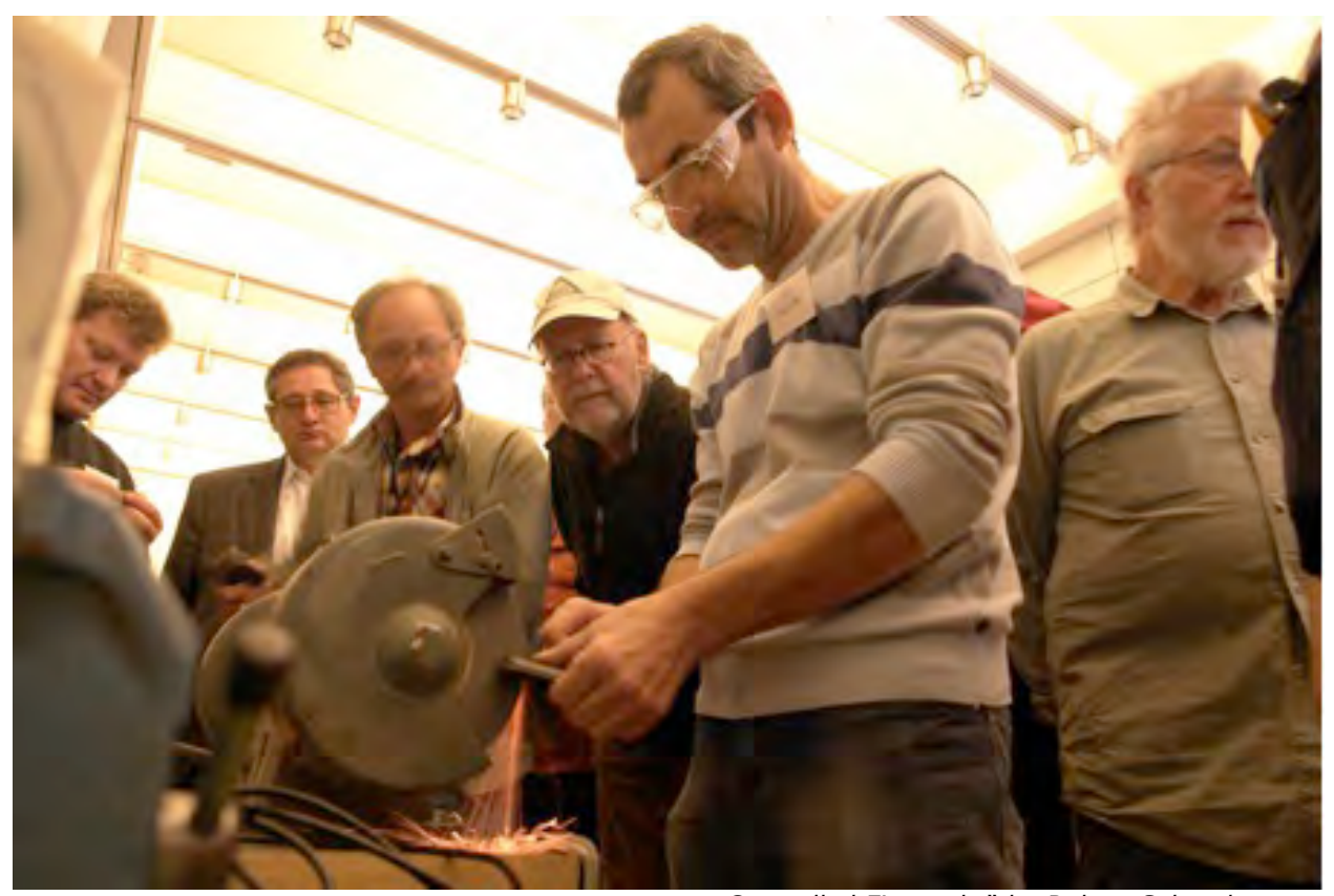
"Controlled Fireworks" by Robert Schander

The majority of rodmakers are using a lathe. Of course the variety of materials, such as different metals or wood, need different cutters.