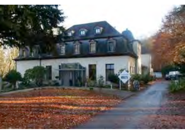
Hotel Hohenfels in Witten GER

Calmly, surrounded by the forests, large lawns for rod tests and pleasant conference rooms helped that the meeting took place in an atmosphere maintained by friendship, in which also the culinary part was important.