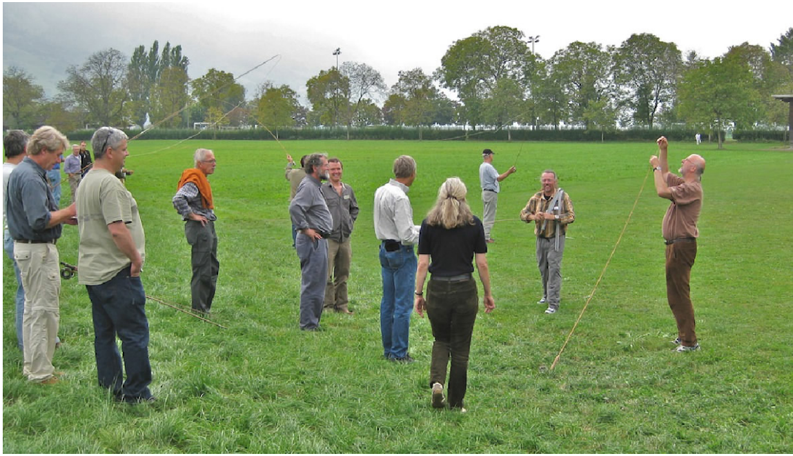
Casting space for everyone

A number of the displayed rods were available for casting. Casting of those and many other rods continued throughout the entire time of the gathering. There were fast, medium, and slow rods, smooth rods, soft rods, long single and double-handed rods, short rods, and even an extraordinarily fast multi-strip rod with a graphite tip. Tapers varied from classic to new and unique. Almost never is there such an opportunity to try so many different bamboo rods. In addition, seldom does a rod maker have a chance to have such a highly varied “audience” cast and evaluate one or more of his rods.