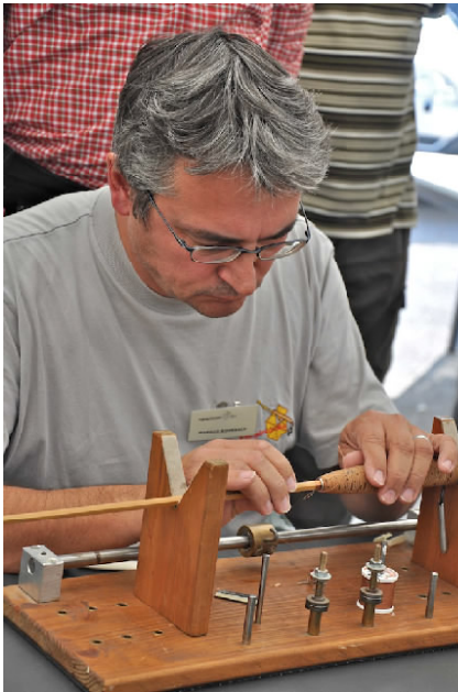
Wrapping: Markus Rohrbach