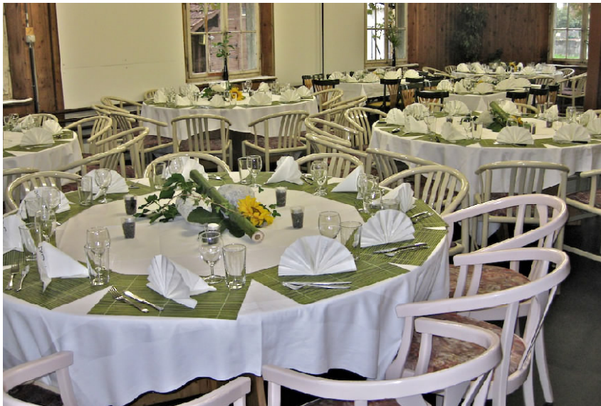
The beautifully decorated dining room