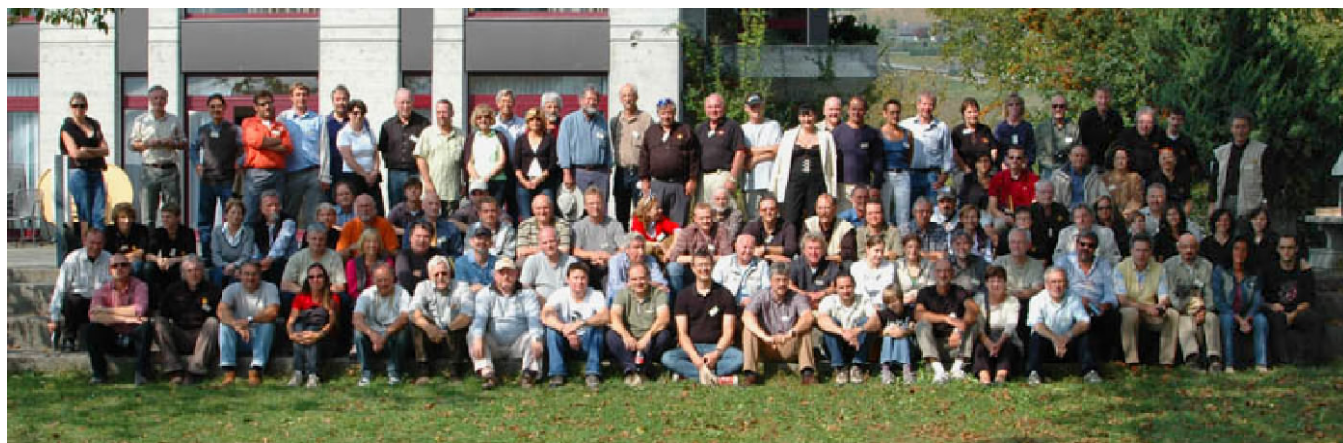
The happy participants

The 2nd European Rodmakers' Gathering took place in Sarnen, Switzerland from Friday, 25 September 2009, to Sunday, 27 September 2009. It was a top-notch celebration of split-cane rod making. The setting was wonderful (it is hard to beat a picturesque town on a lake in the Swiss Alps) and the gathering absolutely outstanding. Participants came from Sweden, Denmark, Germany, France, Great Britain, Italy, the United States, South Africa, Japan, and, of course, Switzerland. The languages heard the most were German, Italian,