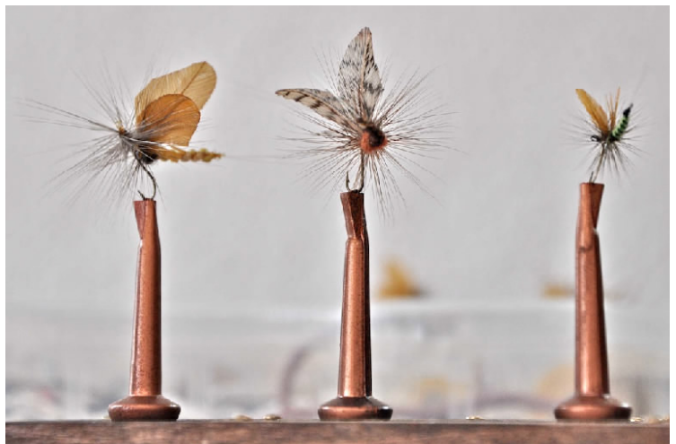
Some of Terenzio Zandri's flies